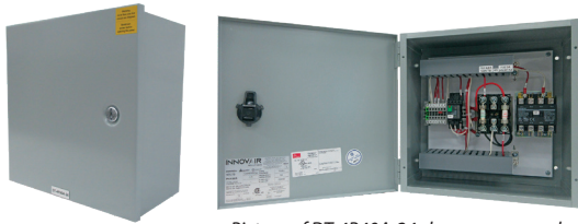
Picture of DT-4P40A-24 shown as example.